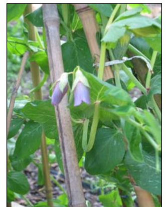
blue & yellow snow peas (edible pods)