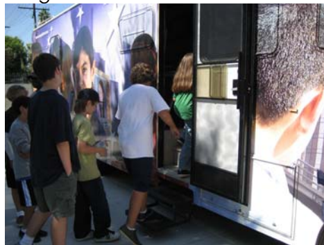
Students enter the Mobile Film Classroom

The Waverly Middle School students embarked on a bus journey this week—without leaving campus! The Mobile Film Classroom (MFC), designed and built by the Mary Pickford Institute for Film Education, will be parked in front of our high school campus two afternoons a week for the next few weeks, as our middle school students learn how to create their own films. MFC is a complete digital production unit equipped with iMac workstations, professional video and audio editing software, and a sound recording booth. Instructors will guide students through the digital media creation process as they take part in every aspect of production, from writing and narrating, to film and music editing.