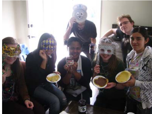
French II enjoying crepes on Mardi Gras