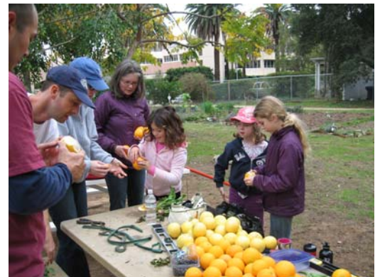
Waverly students enjoy fresh farm oranges

Our last work day left our shed and farm implements storage area in a neat and tidy condition. Please help keep it that way by putting tools away and taking trash back to school. Also, if an item has a clear purpose for use in growing plants, such as a tomato cage or pea trellis, please do not remove it from the storage area next to the shed. Tomato days are ahead!