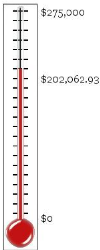
Annual Fund Participation