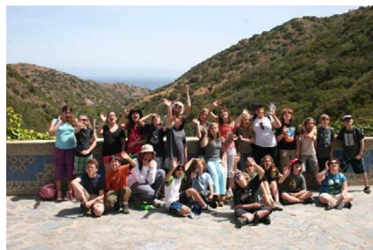
Wasabi on Catalina