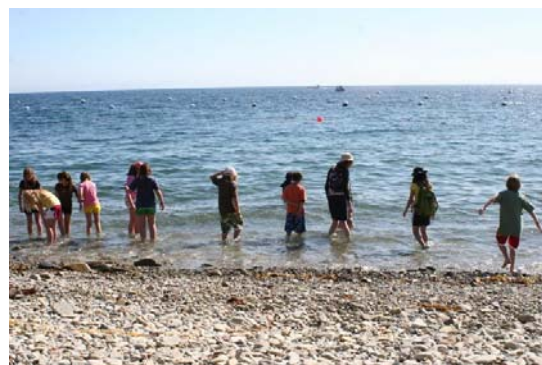
Wasabi enjoying the shoreline