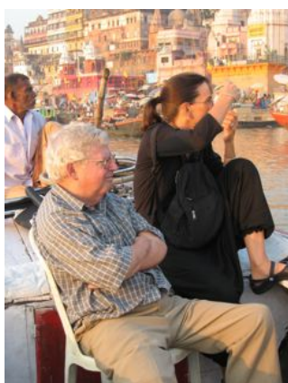
Watching bathers at sunrise in the Ganges River.

They saw the cities of Varanasi and Kochi, Kerala Backwaters, Periyar National Park, and Madurai and Mumbai, where they visited Gandhi museums.