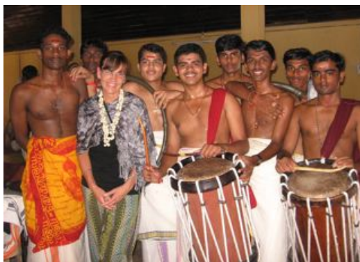
With musicians who had played at a Hindu ceremony.