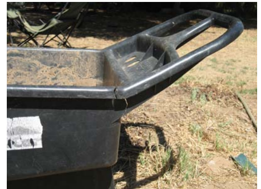
Our broken wheeled cart

This week I found our only working wheeled cart full of water and tools with its handle broken! Let's not let anything like this happen again!