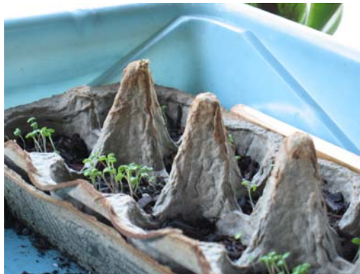
Seeds sprouting at the Farm